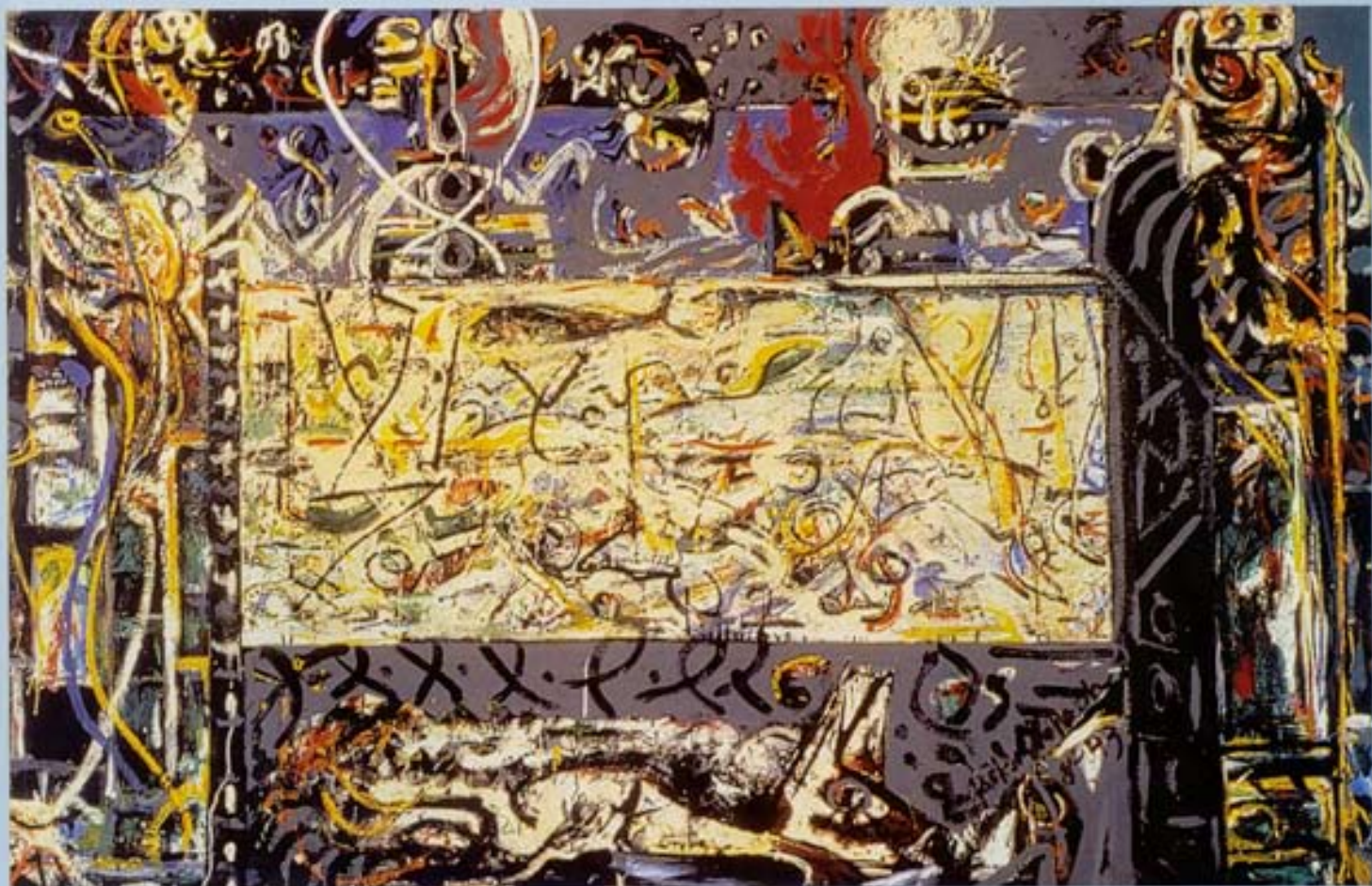
"Guardians of the Secret," 1945, oil on canvas, by Jackson Pollock, one of the leaders of the 1950's Abstract Expressionist movement.